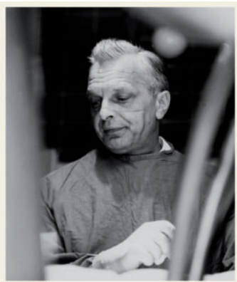
Figure 2 Werner Porstmann during angioplasty procedure ~1980.